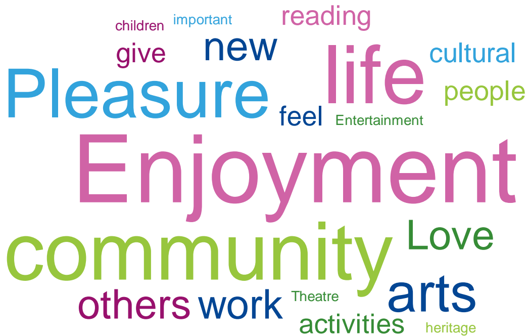
Why do you take part in Cultural activities? - Other (Please Specify)